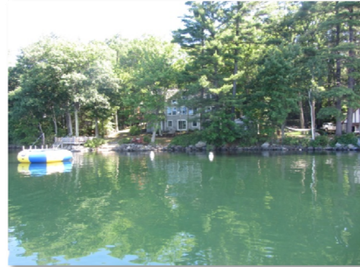
Figure 2. Lake Waukewan parcel receiving a final score of 12