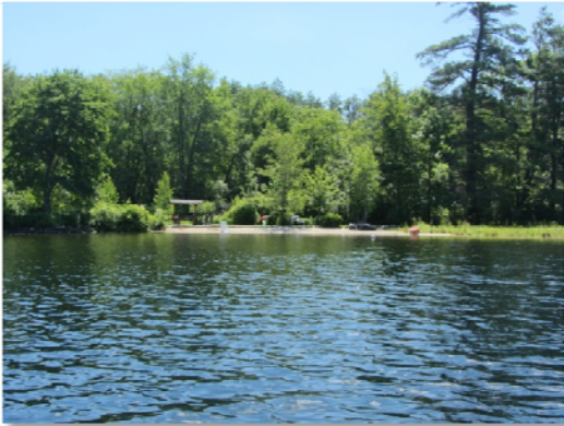
Figure 1. Lake Winona parcel receiving a final score of 7